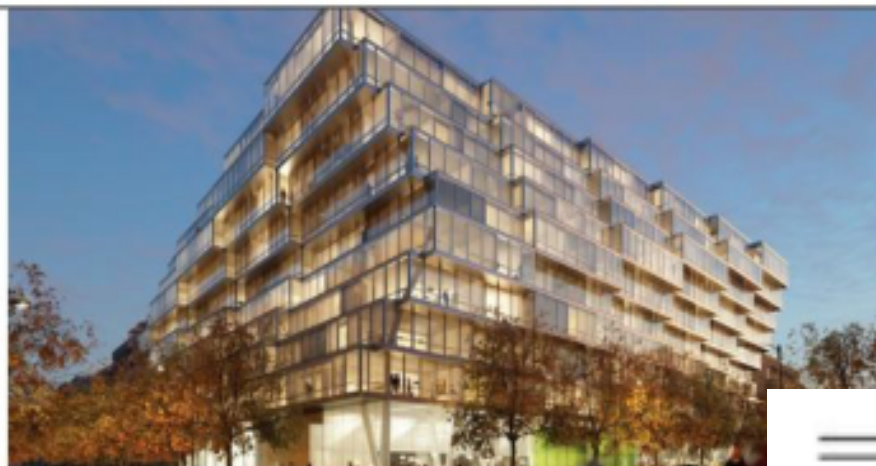
Rendering of the Westlight Condominium Project.