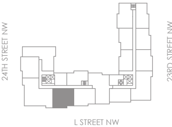
9TH FLOOR BUILDING KEY

9' - 4" CEILING HEIGHTS LIVING ROOM / DINING ROOM 8' - 2" ELSEWHERE (EXCEPT 8' - 0" IN ENTRY CLOSET)